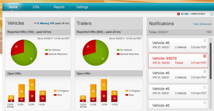
Vehicle Inspection Report Host Dashboard